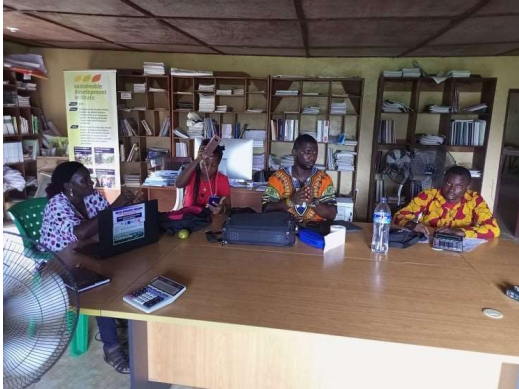
Team reflection meeting at SDI