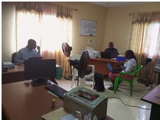
Follow up meeting with GLA partners with CS-IFM